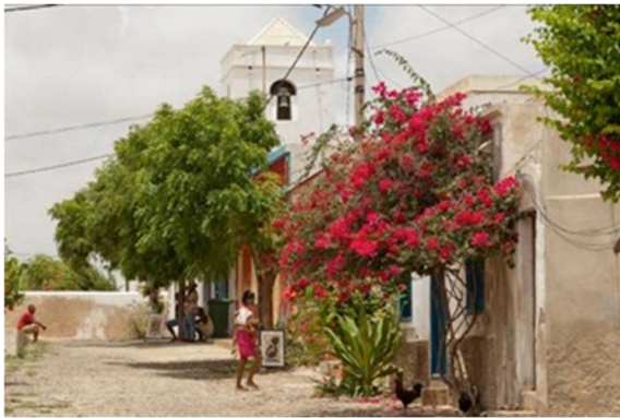
Fundo das Figueiras