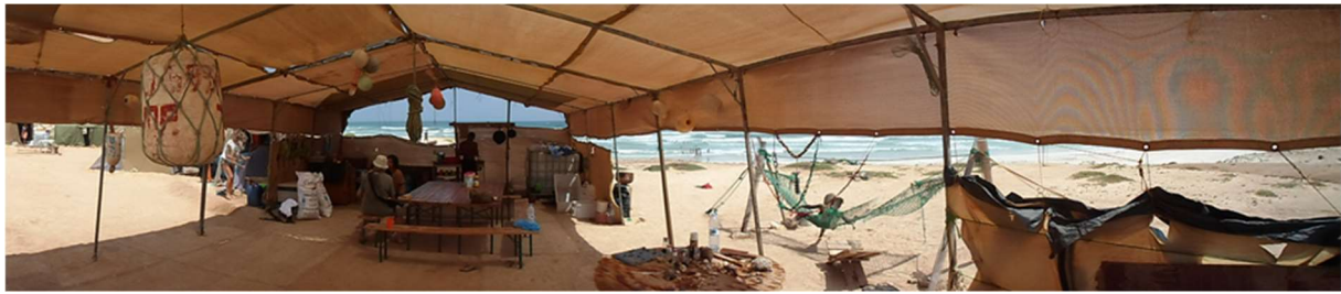
Boa Esperança Camp