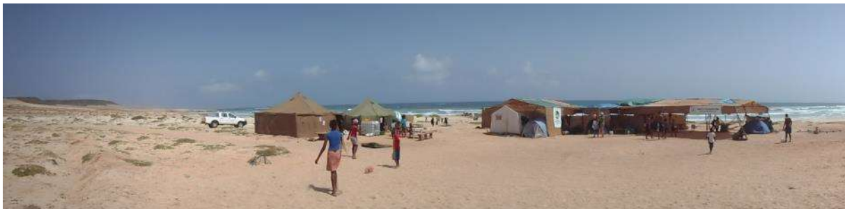
Boa Esperança Camp