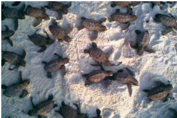
Sea turtle hatchlings

All participants are expected to fulfil certain requirements. Work is extremely demanding, both at a physical and mental level, and these requirements are just to ensure you bring the right expectations and enjoy your experience in Boa Vista.