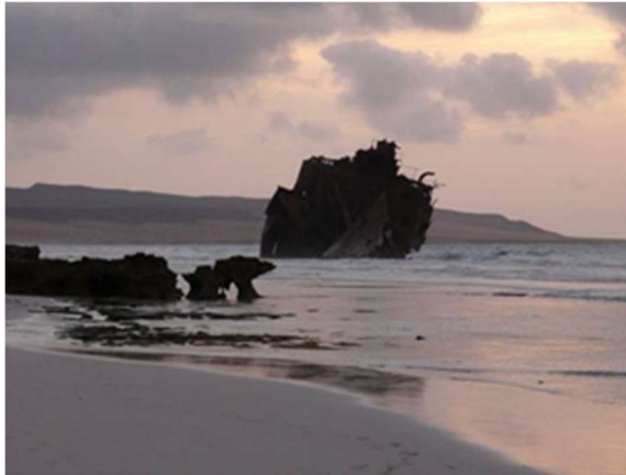
Wreck of the "Santa Maria"

A hatchery is built on Boa Esperança to monitor the high level of predation through ghost crabs.