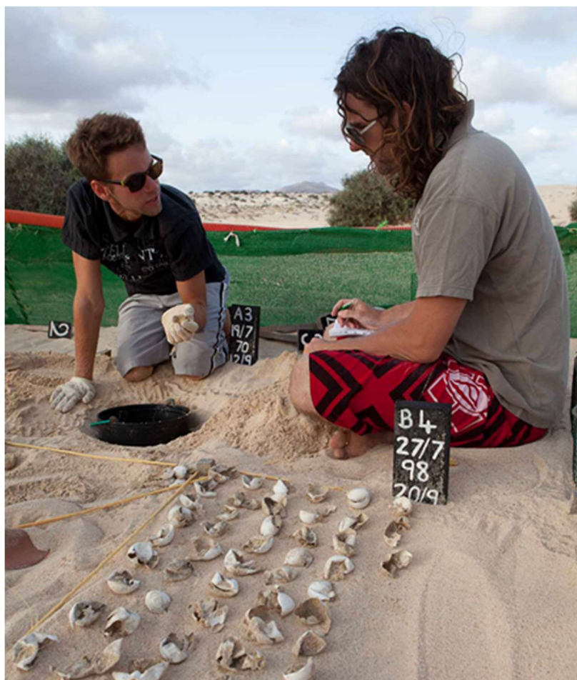
Working in the hatchery

Successful candidates will gain valuable experiences and insights into the Turtle Foundation's sustainable approach to tourism.