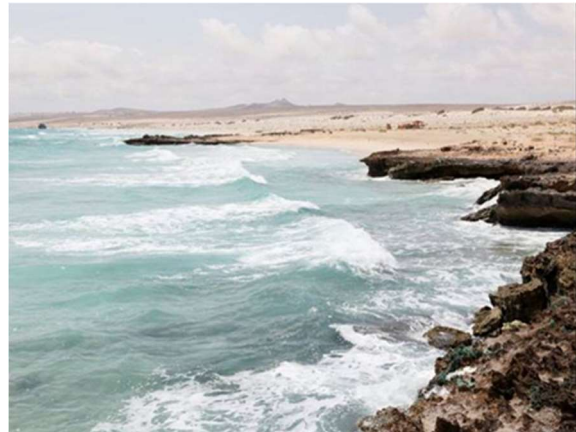
Boa Esperança Beach