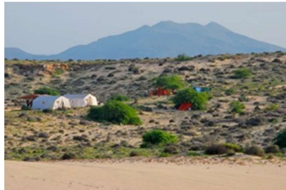
Lacação Beach Camp

Interest in participating in data collection, hatchery management and/or eco-tourism. Must be very comfortable living for at least 2 weeks in a very remote area in a self-catering camp setting with basic sanitation and limited water supply. Must endure extreme hot weather. High level of fitness and independence required. Bear in mind that the surf can be extremely powerful in the south of the island. Transport to town will be organized several times per week; daily transport for days off is not possible, though. For security reasons, we do not recommend hitchhiking to town.