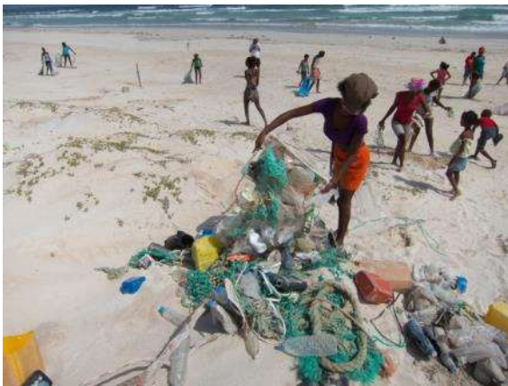
Beach clean up in Boa Esperança