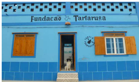
Turtle Foundation headquarter in Sal Rei