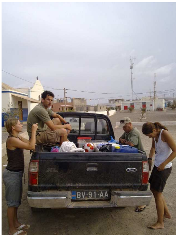
Ready to drive to the camp