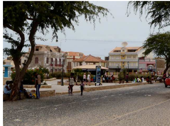
Sal Rei, the capital of Boavista