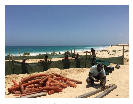
First part of hatchery construction

The hatcheries are going very well, but this year some circumstances are a bit different. All other years we had only one hatchery that was located at the beach of Ponta Pesqueira near the Lacacão field station. This year we have one more hatchery near the Boa Esperança camp. Since at the Boa Esperança beach we observed high predation rates of nests and hatchlings by ghost crabs we are testing if hatching and survival