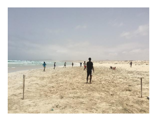
BE x Norte

The Turtle Foundation celebrated its 10<sup>th</sup> nesting season on Boavista and the 5<sup>th</sup> birthday of Fundação Tartaruga with a big party in the Boa Esperança camp. This year we had around 60 guests at the party, staff and their relatives, rangers and volunteers from all 5 camps. It all started with a meeting with the members of the office to discuss the entire logistics and division of tasks. The day before the party, the office was crazy. Everything has to be prepared and everyone runs to every corner so that everything was arranged, without leaving routine