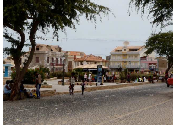
Sal Rei, the capital of Boa Vista