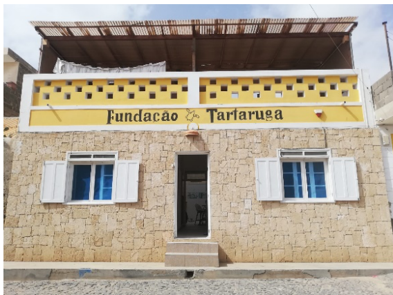
Turtle Foundation headquarter in Sal Rei