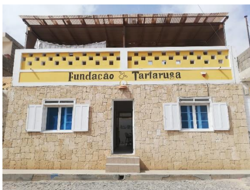
Turtle Foundation headquarter in Sal Rei