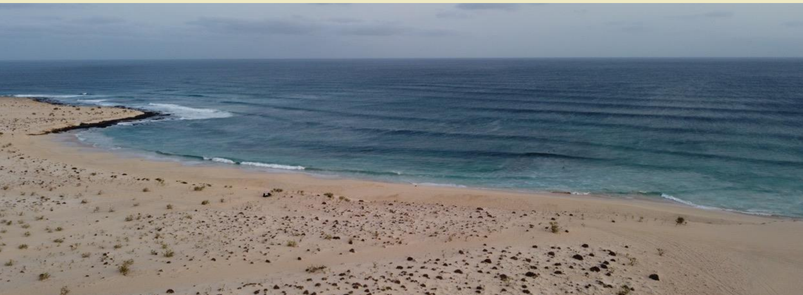
Curral Velho Beach