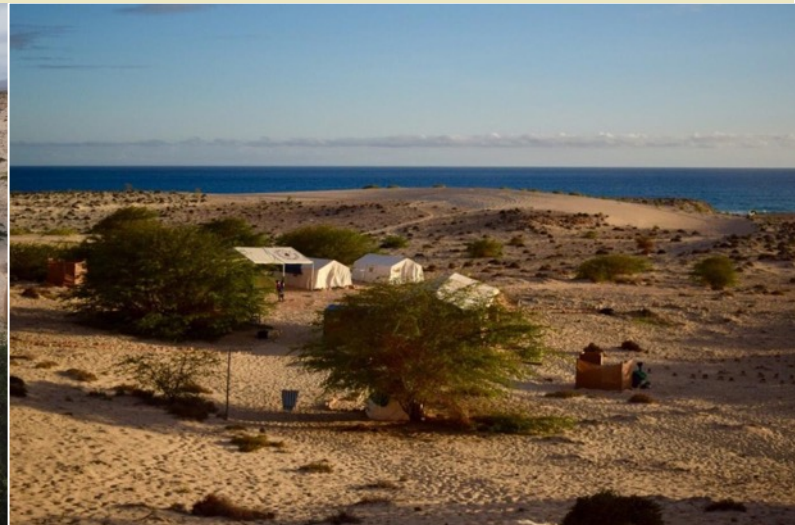
Boa Esperança Camp