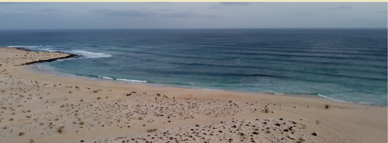
Curral Velho Beach