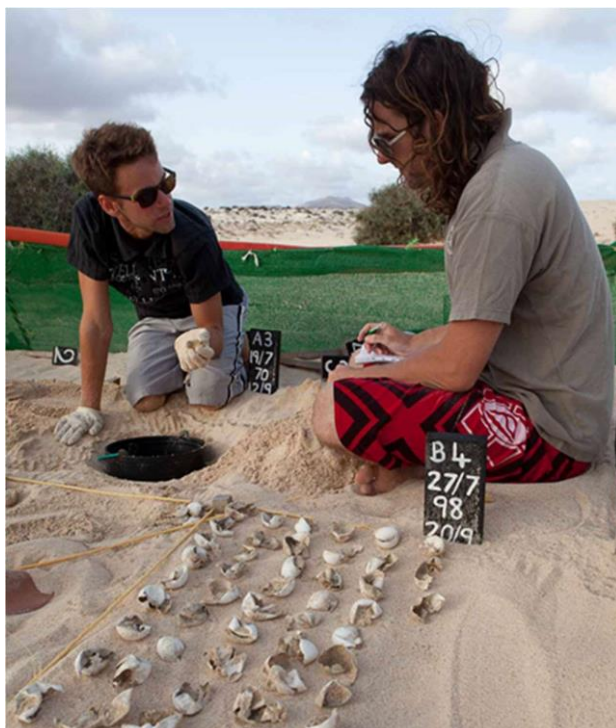
Working in the hatchery

Therefore we receive long term volunteers for the hatchery from 1 st August onwards.