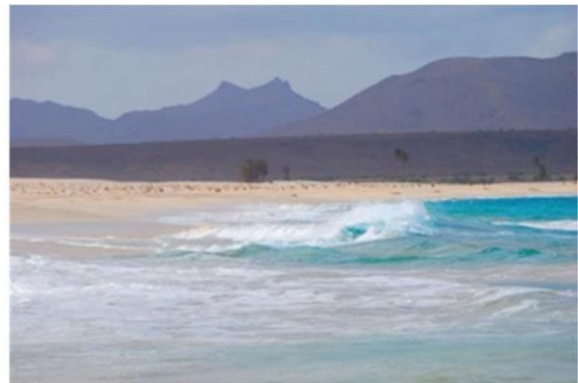
Beach in the South of Boa Vista