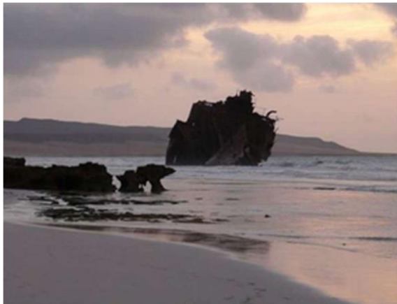
Wreck of the "Santa Maria"

A hatchery is built on Boa Esperança to monitor the high level of predation through ghost crabs.