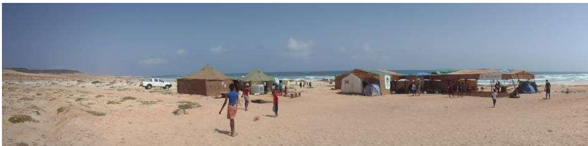
Boa Esperança Camp