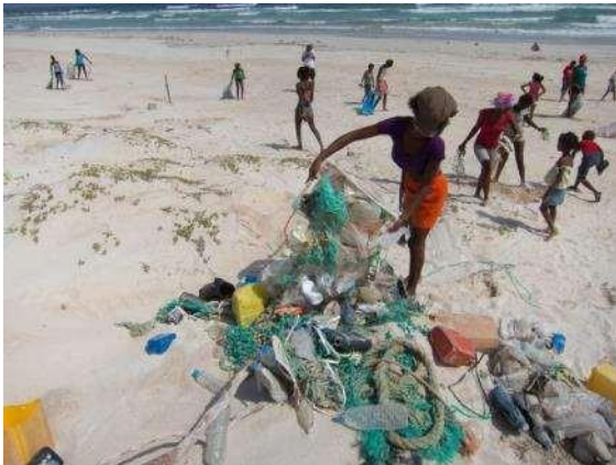
Beach clean-up in Boa Esperança