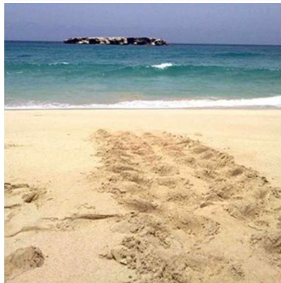
Curral Velho Beach with turtle track