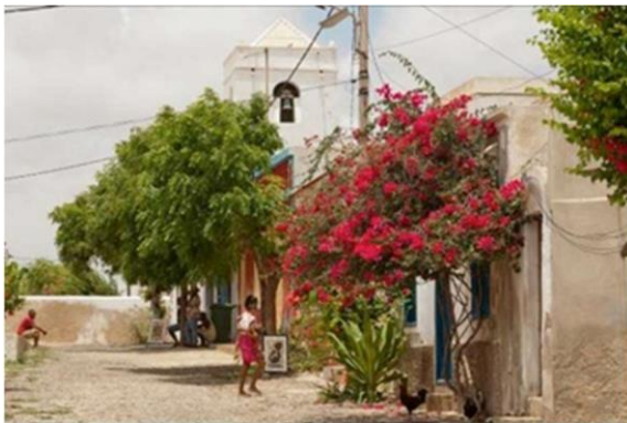
Fundo das Figueiras