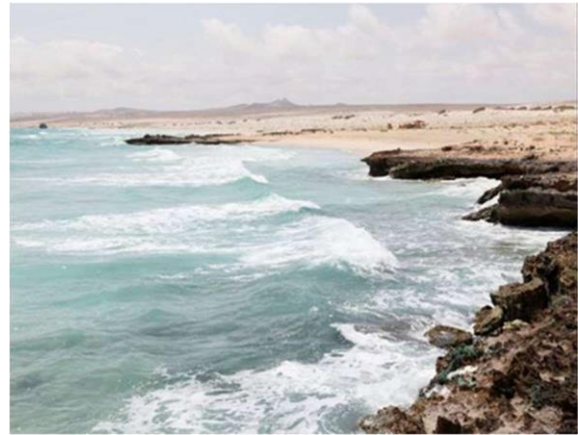
Boa Esperança Beach