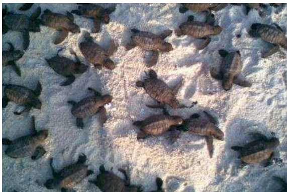
Sea turtle hatchlings

All participants are expected to fulfil certain requirements. Work is extremely demanding, both at a physical and mental level, and these requirements are just to ensure you bring the right expectations and enjoy your experience in Boa Vista.