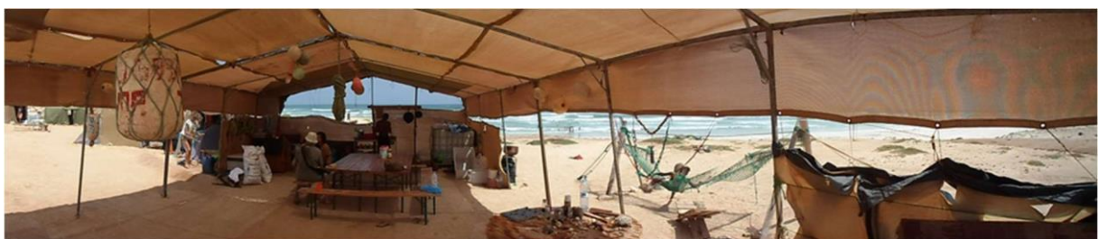
Boa Esperança Camp

For camp and field coordinators Turtle Foundation will incur with the costs towards food and accommodation during their time in the project. Additionally, a small salary of € 450/month will be offered. Travel costs for a return flight to Boa Vista will be reimbursed up to € 500. On free days Camp Coordinators cover their own expenses.