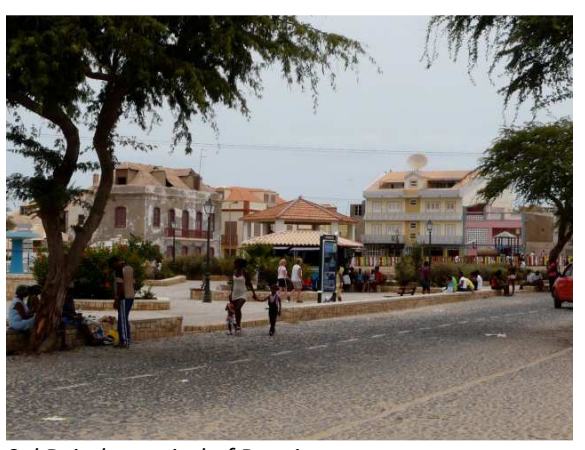
Sal Rei, the capital of Boavista