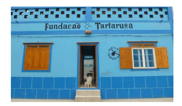
Turtle Foundation headquarter in Sal Rei